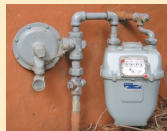
Single-unit residential meter