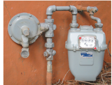
Single-unit residential meter